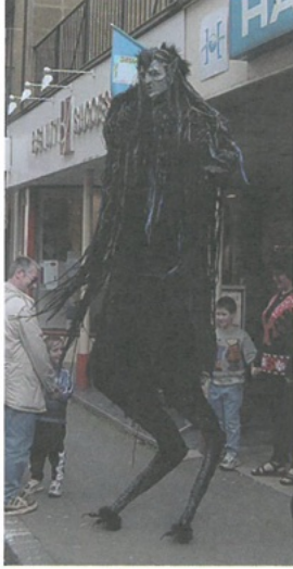
France - Gargoyle