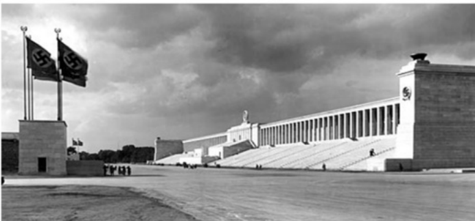
The Zeppelin Grandstand - Nuremberg, Germany (1938) Architect Albert Speer used the Pergamon Altar as a model.