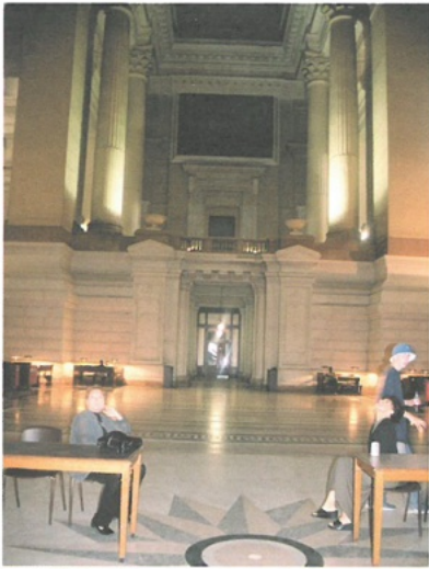
Palais Inside - Floor design