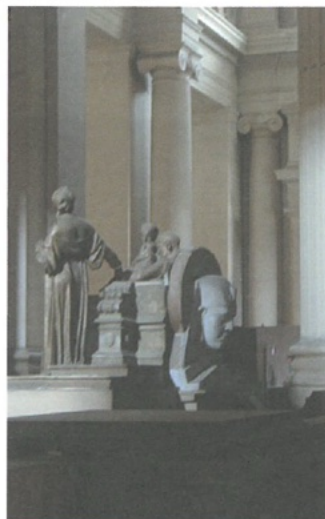
Sphinx and Solomon