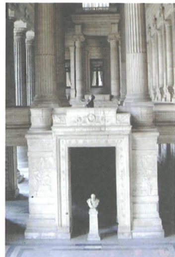
Statue of architect