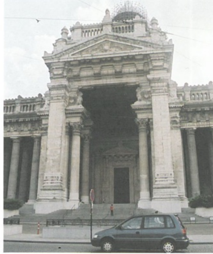
Palais de Justice Entry