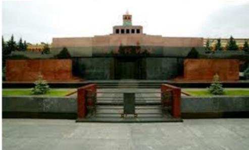
The Lenin Mausoleum with the Kremlin buildings behind it Red Square, Moscow