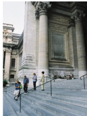
Palais de Justice Brussels, Belgium